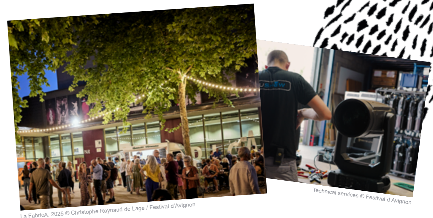
La FabricA, 2025

688 M 2 OF SURFACE INSTALLED WITH SOLAR CANOPIES AND PHOTOVOLTAIC PANELS AT LA FABRICA 2/3 REDUCTION IN ENERGY CONSUMPTION