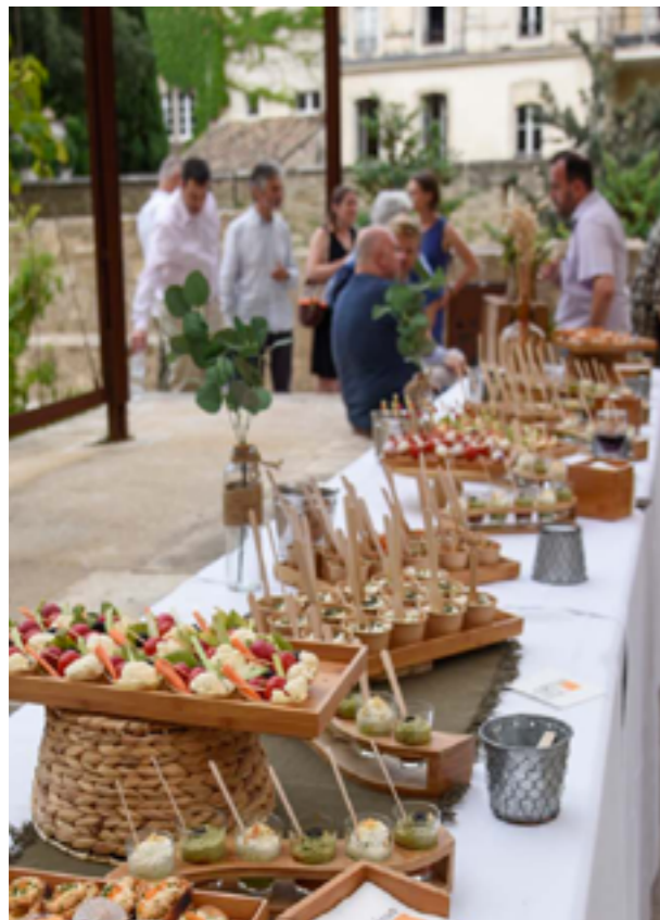
Gardens of the palais des Papes, 2023