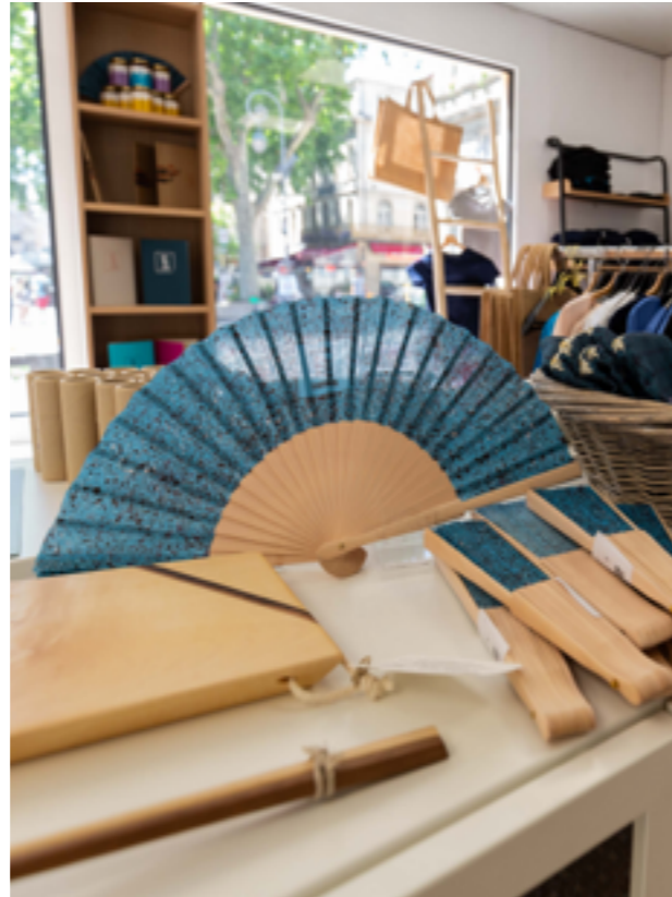
Festival shop, 2021