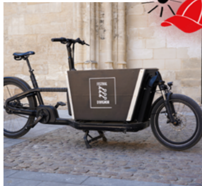
Electric cargo bike, 2025