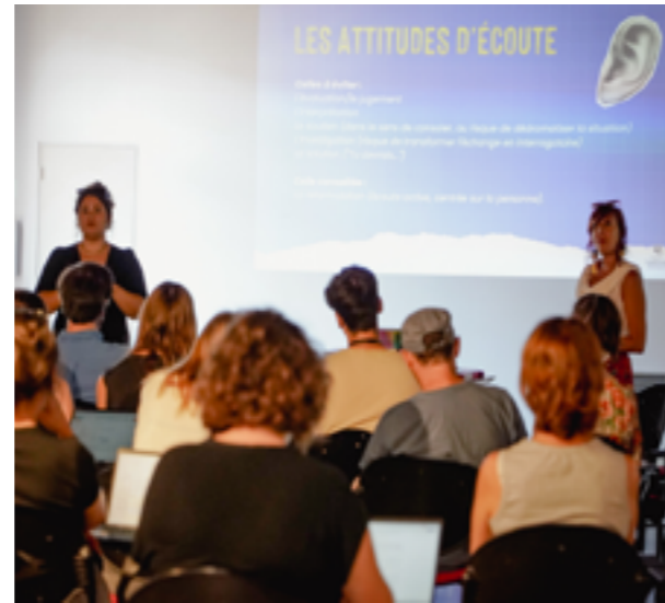
VHSSM training, 2025