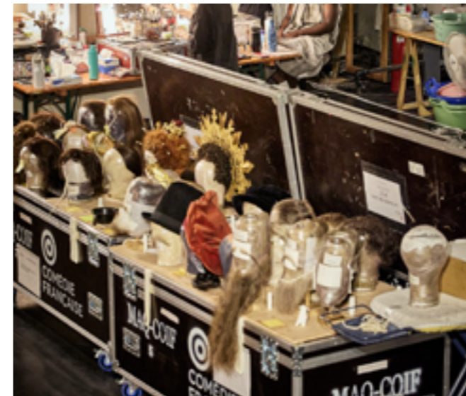
Le Soulier de Satin, Éric Ruf – Comédie-Française, 2025

The Festival is committed to rethinking its equipment and promoting the use of environmentally friendly transportation.