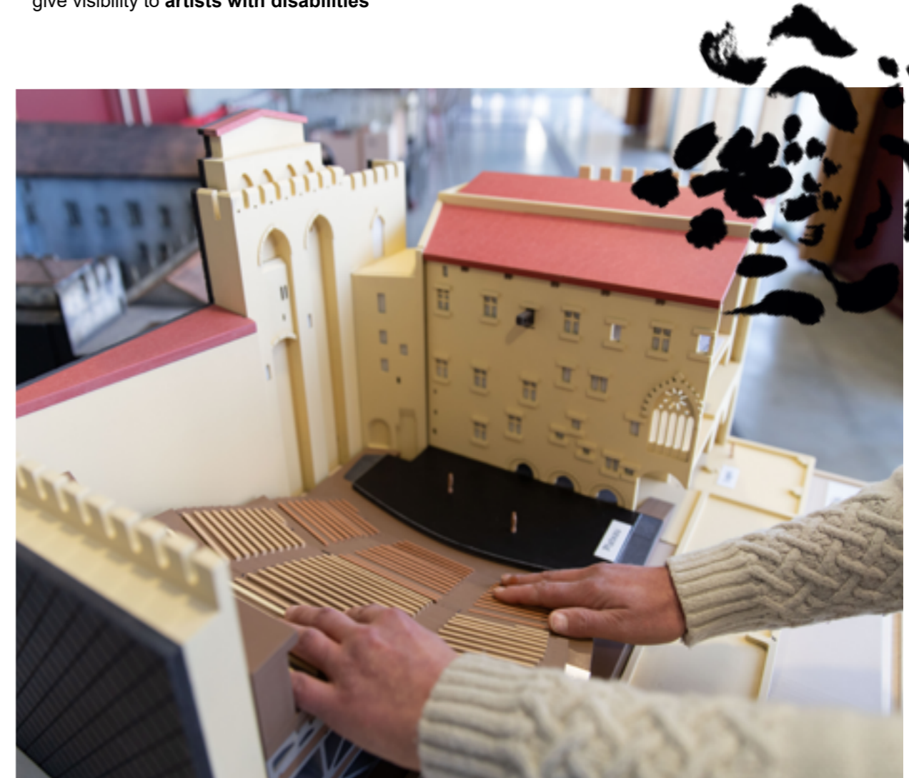
Tactile model of the Cour d'Honneur du palais des Papes, 2023