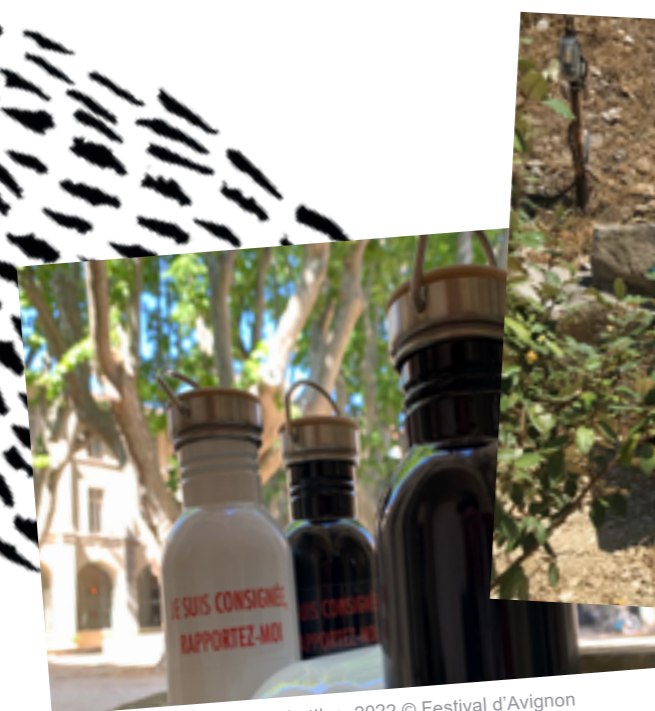
Provision of reusable water bottles, 2022