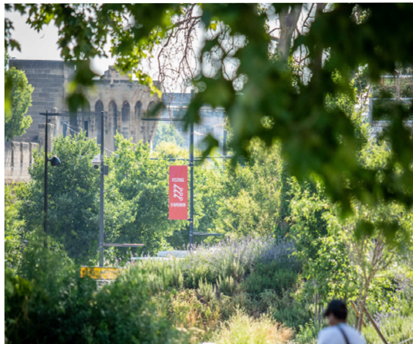
Forecourt of the train station, 2025