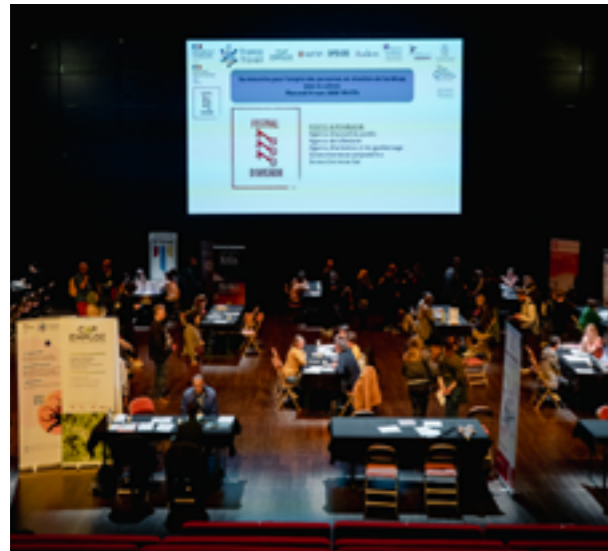
Employment fair for people with disabilities, 2026

By embracing the integration of all forms of diversity, the Festival affirms its commitment to inclusion.