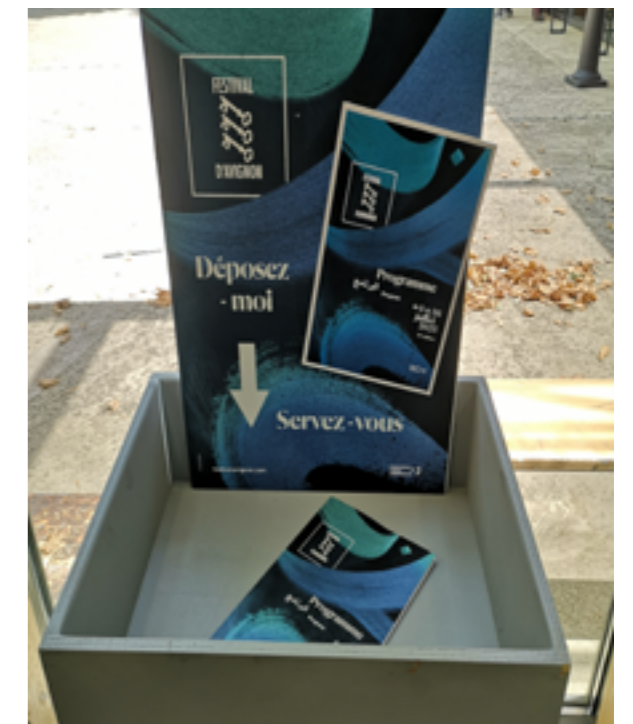
Programme reuse bin, 2025