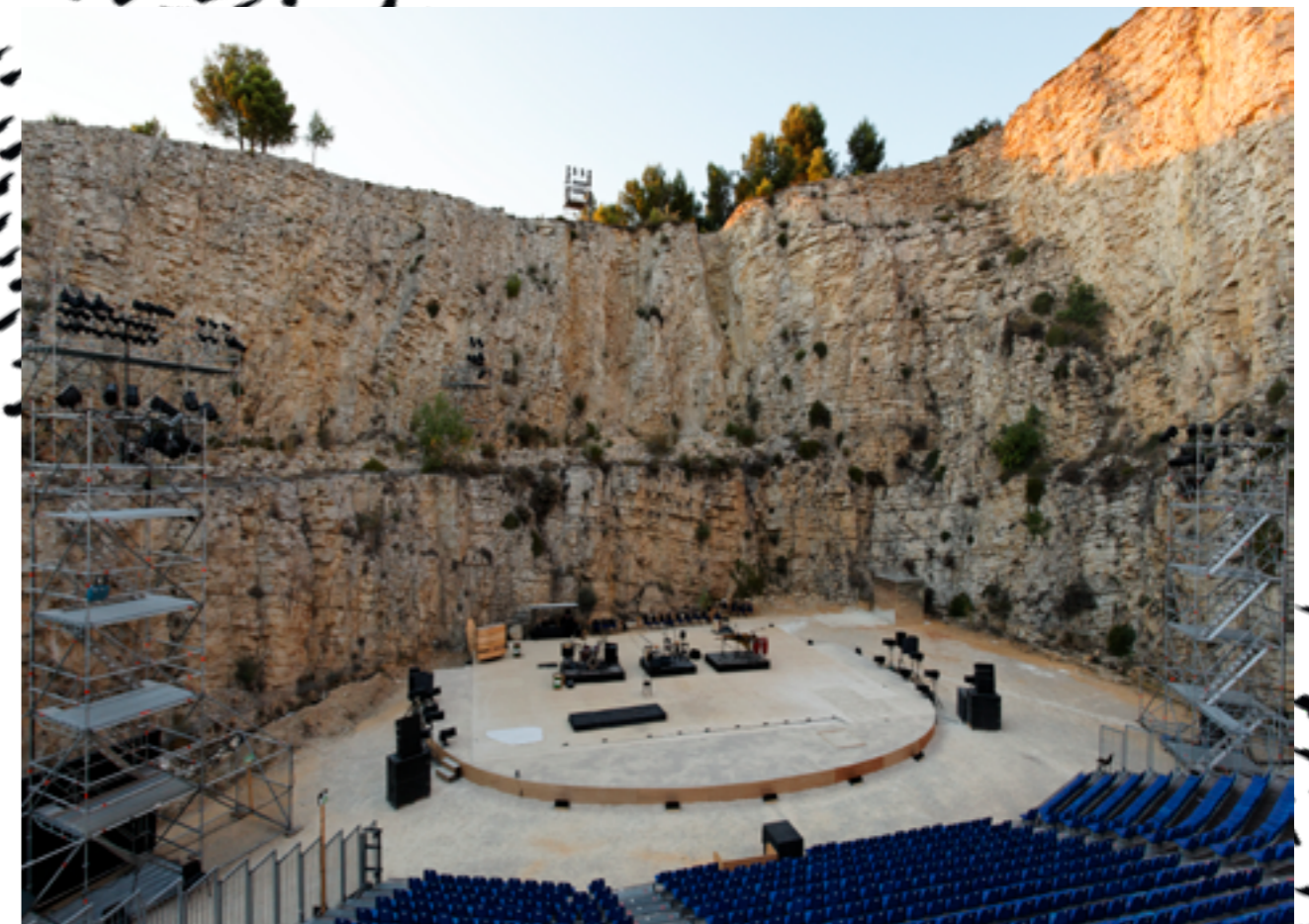
Carrière de Boulbon, 2023