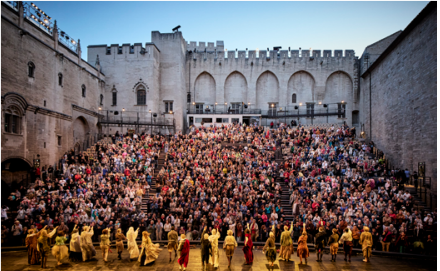
Le Soulier de Satin, Éric Ruf – Comédie-Française, 2025