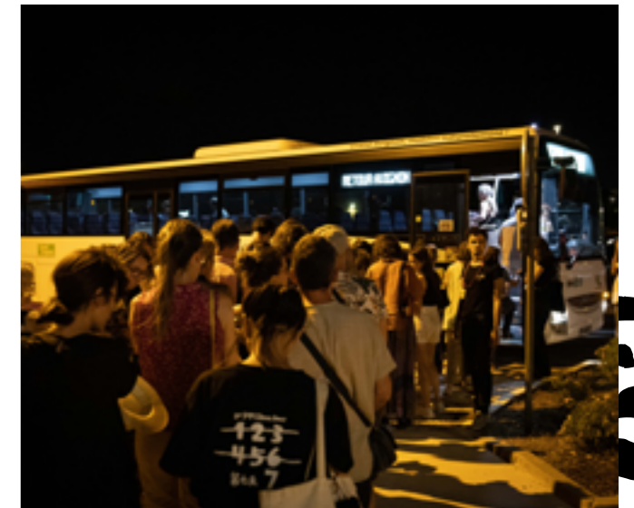
Shuttle services, L’Autre Scène du Grand Avignon – Vedène, 2023