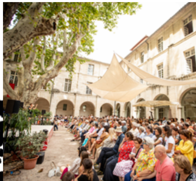
Café des idées, 2025

67% OF JOURNEYS BETWEEN HOME AND THE PLACE OF STAY ARE MADE VIA THE RAIL NETWORK (REGIONAL TRAINS, HIGH-SPEED TRAINS, AND INTERCITY TRAINS)