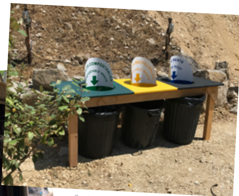
Construction of waste bins at the Carrière de Boulbon, 2025