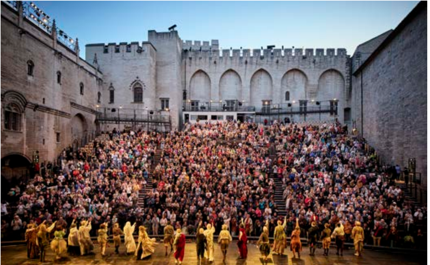
Le Soulier de Satin, Éric Ruf – Comédie-Française, 2025