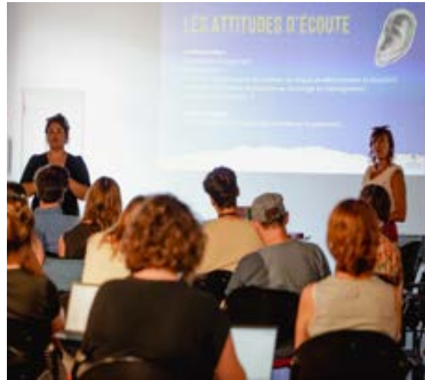
VHSSM training, 2025