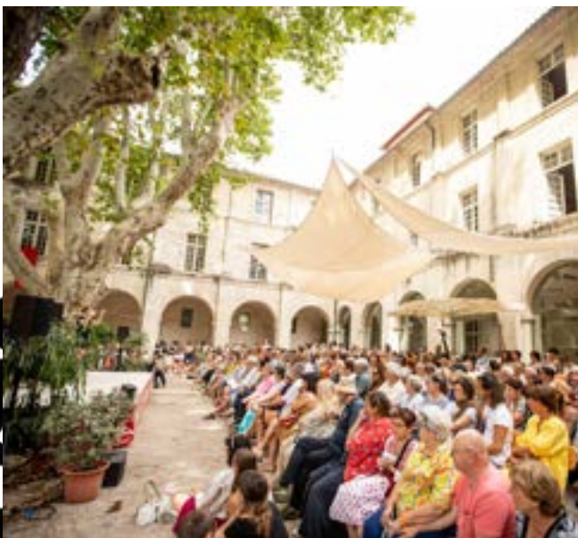
Café des idées, 2025

67% OF JOURNEYS BETWEEN HOME AND THE PLACE OF STAY ARE MADE VIA THE RAIL NETWORK (REGIONAL TRAINS, HIGH-SPEED TRAINS, AND INTERCITY TRAINS)