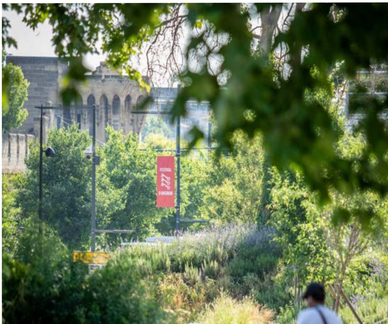
Forecourt of the train station, 2025