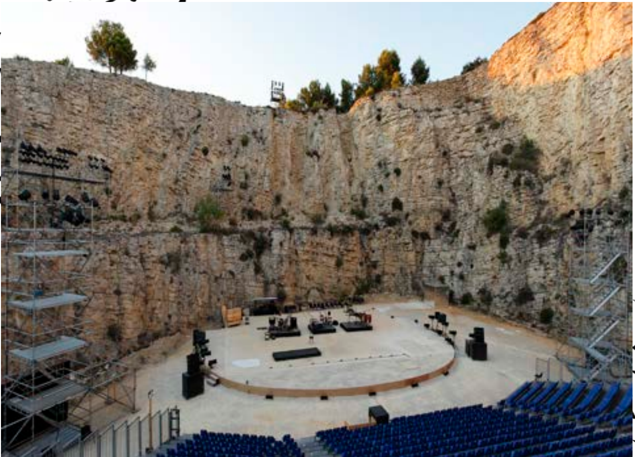
Carrière de Boulbon, 2023