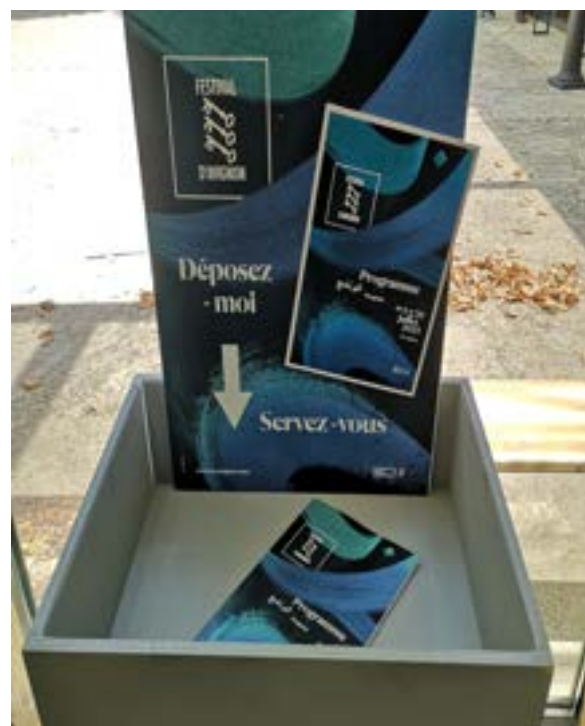
Programme reuse bin, 2025