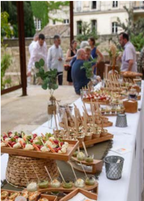
Gardens of the Palais des Papes, 2023