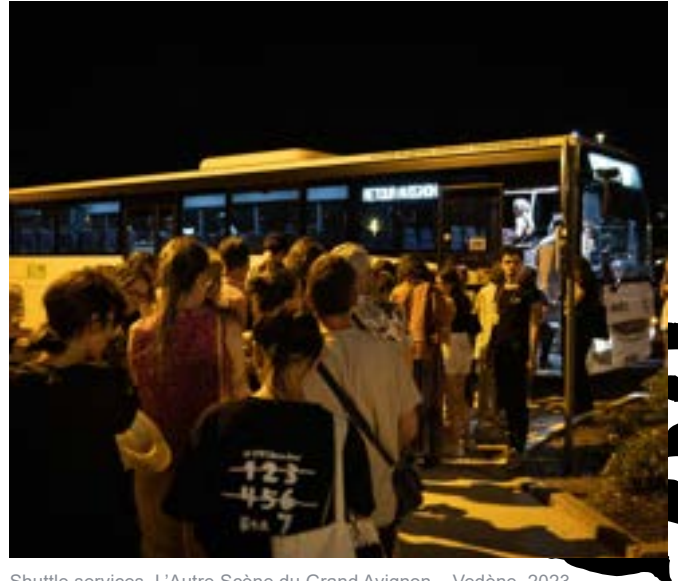
Shuttle services, L'Autre Scène du Grand Avignon – Vedène, 2023