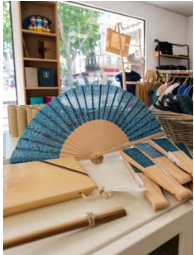
Festival shop, 2021