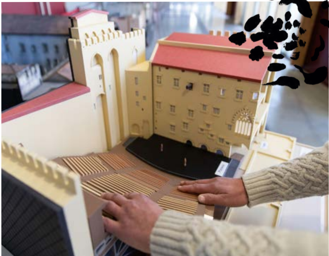
Tactile model of the Cour d’Honneur du palais des Papes, 2023