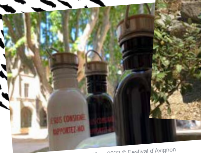
Provision of reusable water bottles, 2022