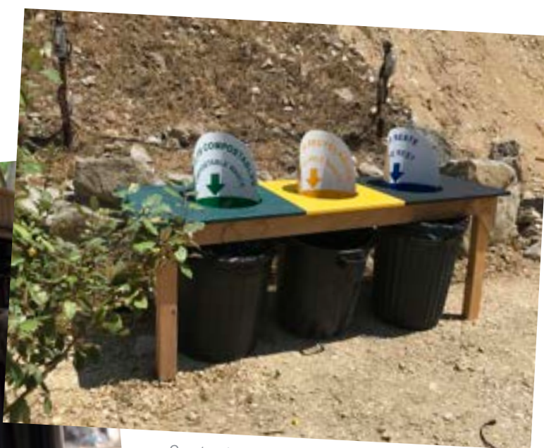
Construction of waste bins at the Carrière de Boulbon, 2025