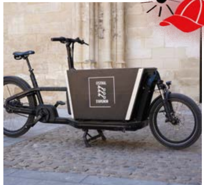
Electric cargo bike, 2025