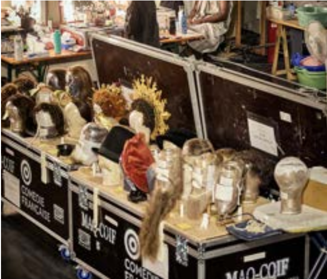
Le Soulier de Satin, Éric Ruf – Comédie-Française, 2025

The Festival is committed to rethinking its equipment and promoting the use of environmentally friendly transportation.