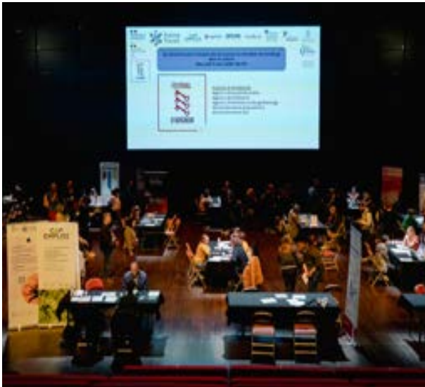
Employment fair for people with disabilities, 2026

By embracing the integration of all forms of diversity, the Festival affirms its commitment to inclusion.